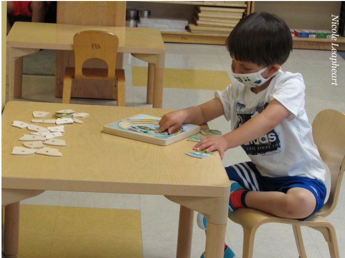
This young learner has adjusted to wearing a mask while working with a puzzle.