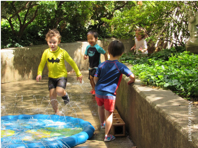
Greene Towne Primary students enjoy splash pads during recess.

Greene Towne Montessori School serves children 18 months old through Kindergarten and is accredited by the American Montessori Society and the Pennsylvania Association of Independent Schools. To learn more, visit www.gtms.org . The school has some spaces remaining for this fall and will soon be taking applications for 2021-22.