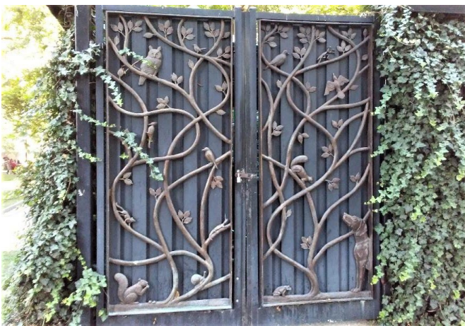
Gardener's Cottage Gates in Rittenhouse Square.

http://www.bergbronze.com/bodyofwork.htm