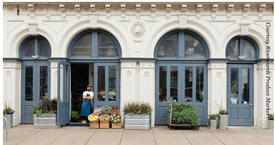
Riverwards Produce Market.