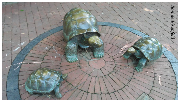
Grizzly and Family of Turtles in Fitter Square.

"The motivation behind my sculpture comes from an early childhood fascination with animal life and the natural world. The goal of my work is to place hands-on, accessible public art works which, through their character and natural appeal, foster an appreciation and respect for animal life.... and the subtle reinforcement of the beauty and value of these 'other than human' living beings."