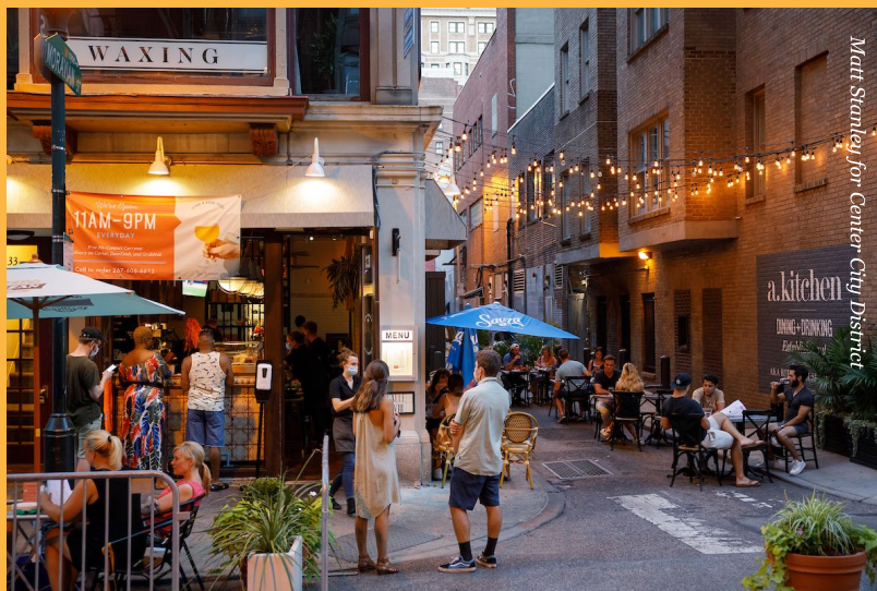
Moravian Street at 18th, repurposed for dining.

The Center City District has also issued a report on the subject of outdoor dining, tracking the progress of the move outdoors, and pointing out that restaurants provide a lot of jobs as well as happy diners. To see the report, Click Here .