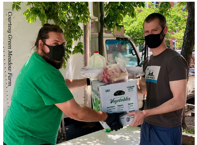
Green Meadow Farm.