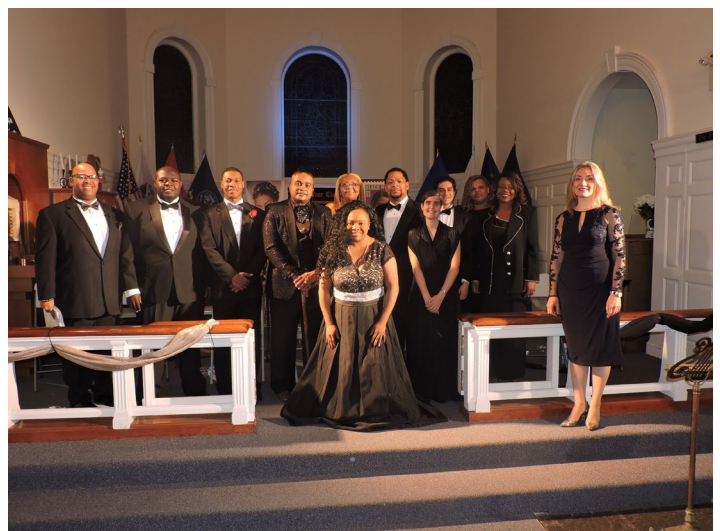
Marian Anderson Museum & Historical Society Concert Ensemble.