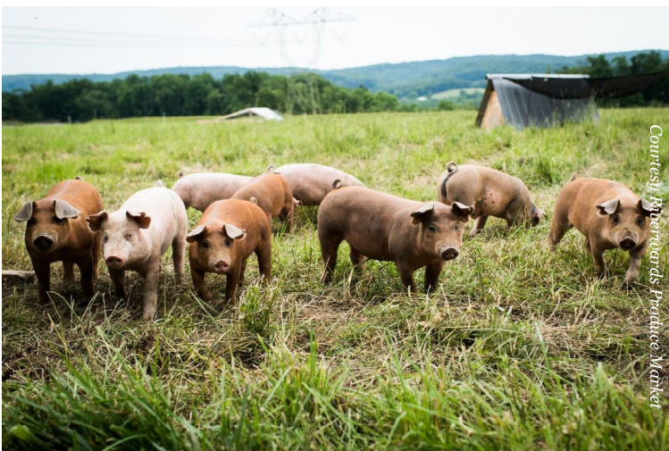
Primal Supply Meat.

Philly Foodworks offers a discount to CCRA members. Use the code "CCRA" when signing up for home delivery and receive a $20 discount on delivery charges.